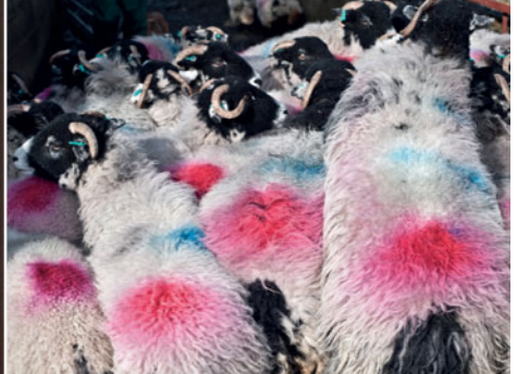
Left: Sunset on the hillside Below: Ewes after tugging