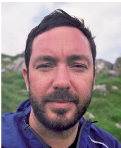
Social documentary photographer Neal Andrews